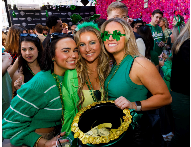
Madi St Patty 300+ attendees