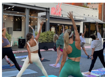
Sweets & Sweats