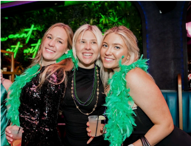
Madi Mardi Gras