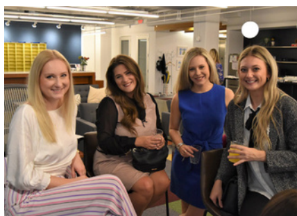
Alumnae Panel & Headshots