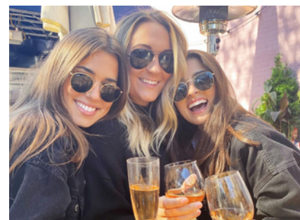
Philanthropy Walk / Brunch