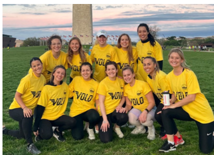
Kickball on the Mall