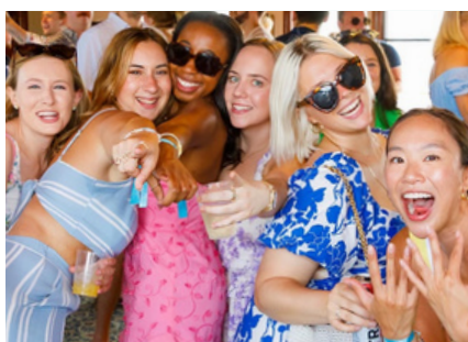
Party on the Potomac