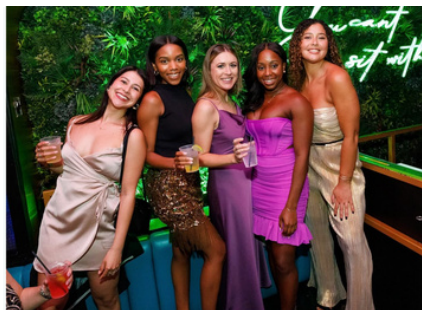
Meet The Madison