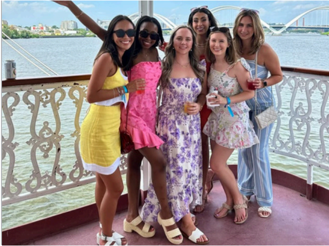
Party on The Potomac 250+ attendees